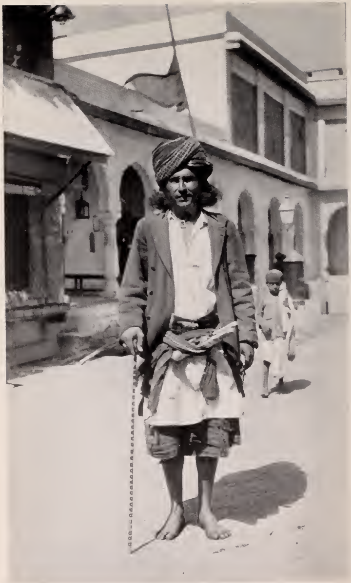
An Indian hill-man